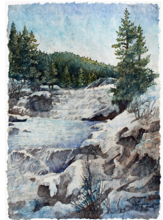
Joanne Simpson - NWS watercolor 'Little Salmon River'